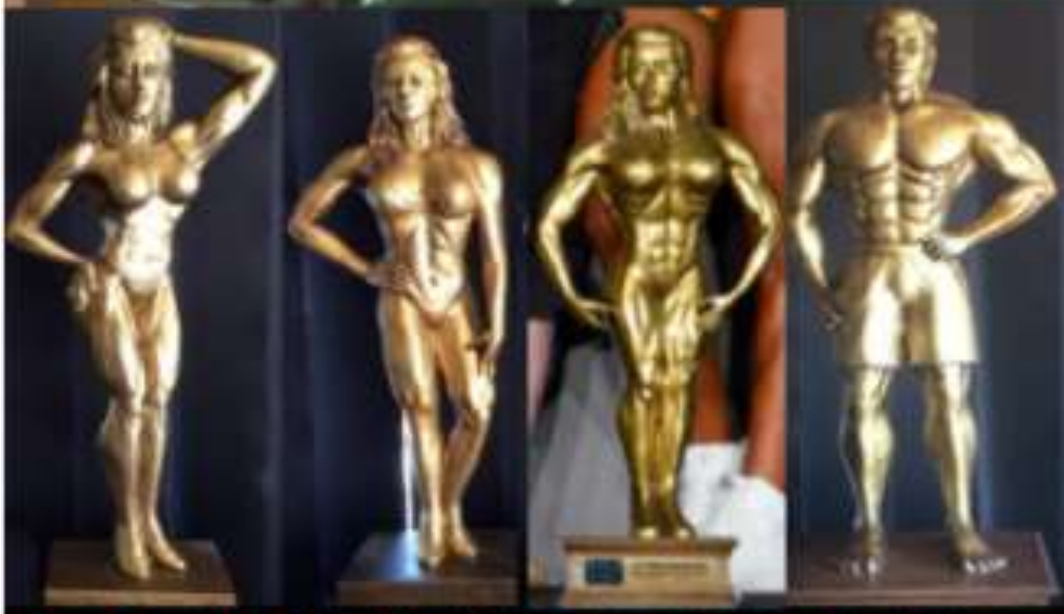
Sports Model – Bikini Model – Fitness Model – Men's Fitness