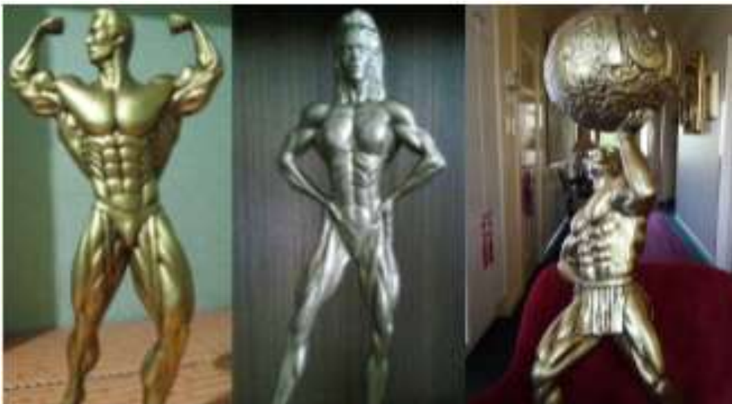
Men's Bodybuilding - Ms Figure - Mr Physique

ICN provides a range of incredible Statues for our Open Class Champions. Notwithstanding they are the biggest in the world, these Statues are exclusive to ICN Australia and cannot be won elsewhere and are not available for sale.